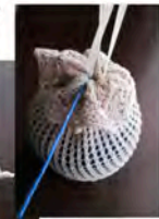
The drawstring loops can also be placed over your arm for on-the-go knitting.