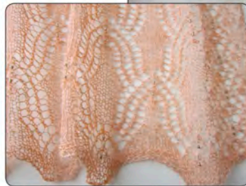
Shown in Red Barn Yarn Lace Glow color Imperial Orange Topaz; Miyuki beads color #234 Metallic Gold-lined Crystal

Skill Level Intermediate or adventurous advanced beginner lace knitter