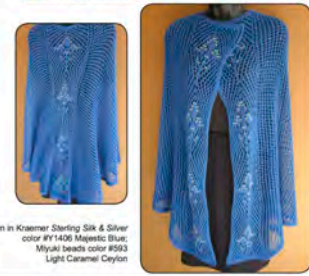
Shown in Kraemer Sterling Silk & Silver color #Y1406 Majestic Blue; Miyuki beads color #593 Light Caramel Ceylon