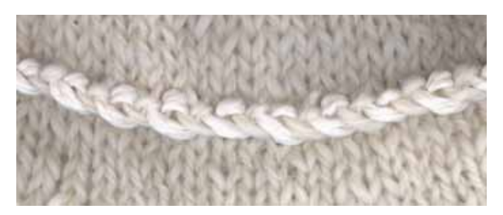
Detail of Norwegian Braid Band

(C) Treenway Reeled Bombyx Silk #0 (50g/150 yds) undyed natural (we doubled this yarn, so allow twice the stated yardage in the pattern)