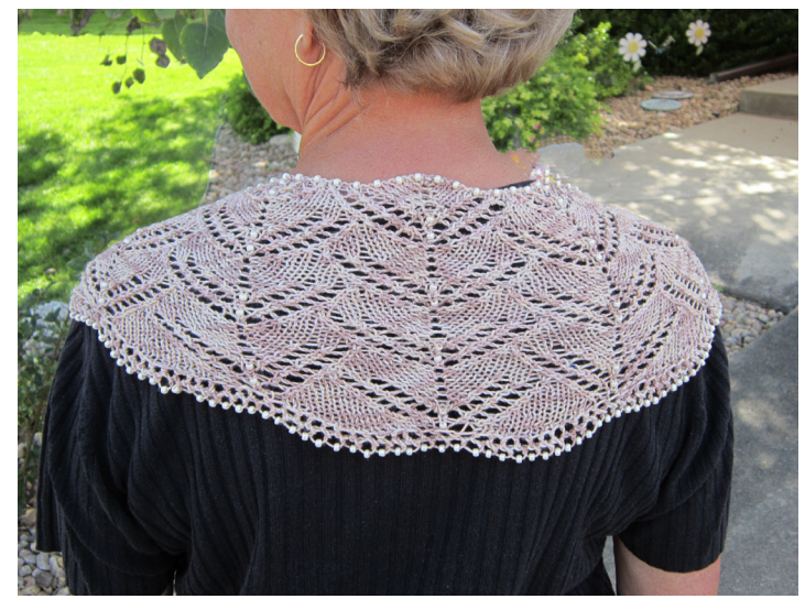
Finished Size 58" wingspan by 8" depth